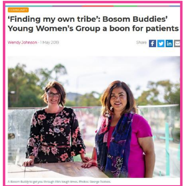
The RiotAct Article

Tonic Health - GP brochure boards contract was renewed for 2018/2019. The boards provide another way of reaching a new audience about the importance of early detection. The Bosom Buddies shower tags are present in 65 medical centres waiting rooms across Canberra.