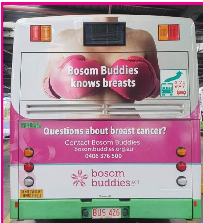
Action Bus advertising during October and November 2019

Australian Small Business & Family Enterprise Ombusman (ASBFEO) Mother's Day Classic Launch Breakfast Millennial Pods Pink Ribbon Breakfast Conder-Lanyon Probus Harrington Kibbey Law Firm Multicultural Festival Erindale Women's Health Expo Shakespeare by the Lake Bunnings Belconnen International Women's Day Event @ CSC Seniors Expo Tamil Women's Dinner CPA Annual Lunch Woden Probus Veritec Down Syndrome ACT Copland College Isabella Gardens Independent Living Village Dragon's Abreast Regatta Volunteering Expo Teachers Health Expo Fernwood Woden SHOUT Nishi Building Suitcase Rummage Skew Communications Bungendore Young Mother's Group Aspen Health The Grove Ngunnaway Calvary Health Expo Mental Health & Wellbeing Expo Digital Transformation Agency Pink Ribbon Fundraising Breastfast @ AIS Pink Ribbon Fundraising Breakfast in Yass