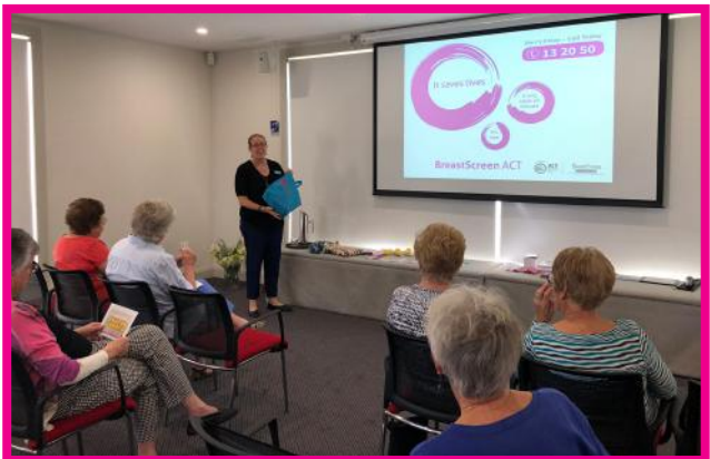
Isabella Gardens Independent Living