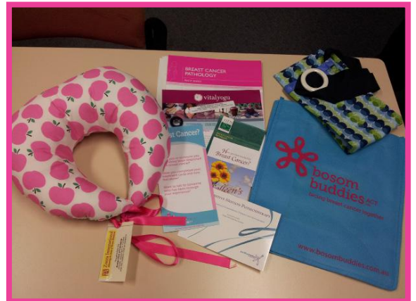
Blue Buddy bag & contents