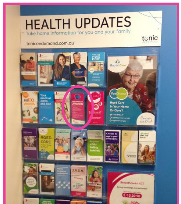
Tonic Health - GP brochure board