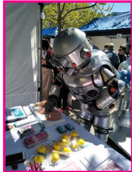
Mental Health & Wellbeing Expo, Canberra City