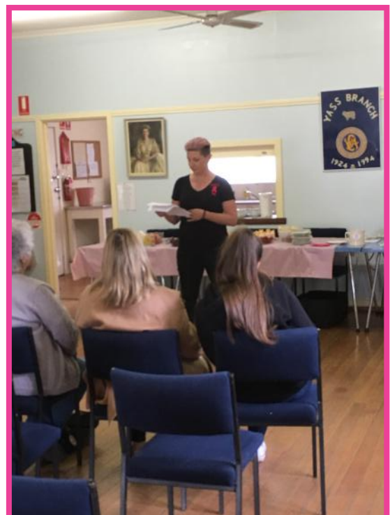
One of our Young Women Group Members speaking at a Pink Ribbon Fundraiser in Yass