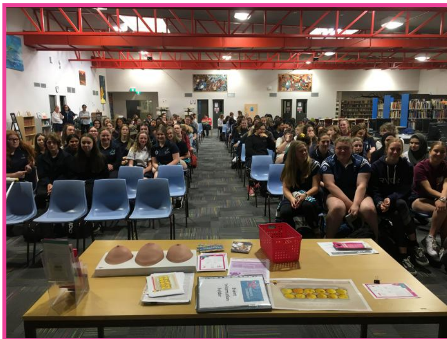
Melba Copland College Students - Years 9, 10, 11 and 12