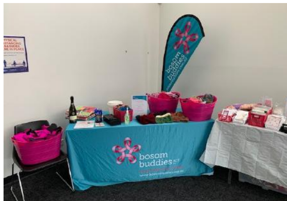
Gungahlin Bulls Football Club Ladies Day