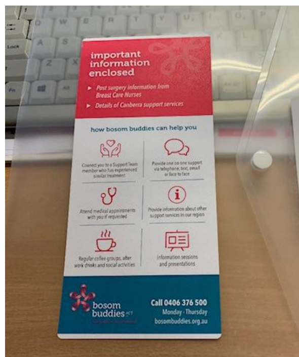
Our new Blue Buddy bag sticker

In addition to the Blue Buddy, we now provide an Oncology Pack for patients who have chemotherapy prior to having surgery. This provides them with useful information and support available, including the offer of support from Bosom Buddies. We are currently investigating the need for a pack for those diagnosed with secondaries.