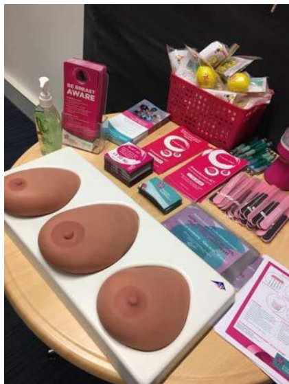
Breast Awareness @ Fernwood Woden