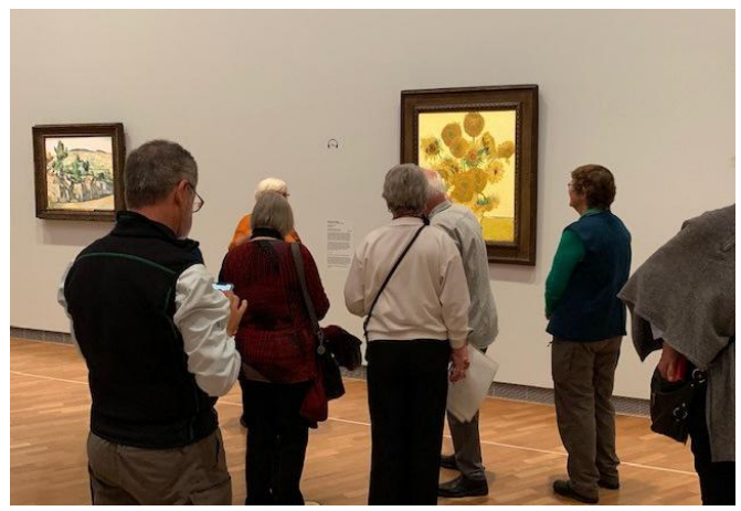
Clockwise from the top left - Young Women's Group @ The Breakr Room; The Mawson Coffee Group; Free Gallery Tour @ NGA; Pinot & Picasso Night