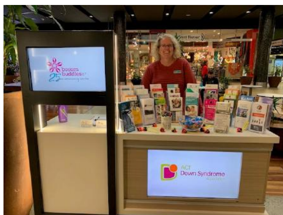
Shopping Centre display @ Westfield Belconnen