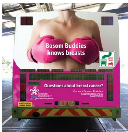
One of four Action Buses

Since 2015 we have handed out nearly 40,000 shower tags that show women and men how to check their breasts to detect differences. Bosom Buddies provides shower tags to BreastScreen ACT and ACT Health centres, and sends them to nurses and Health Centres in the local region.