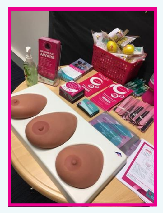
Breast Awareness @ Fernwood Woden