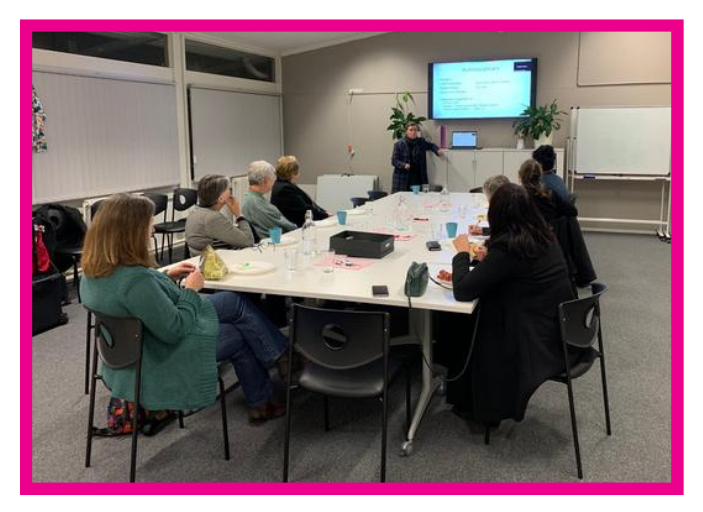
Breast Surgery Options Information Session

Many thanks to all our presenters who volunteered their time.